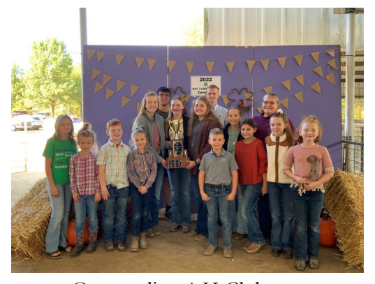
Outstanding 4-H Club