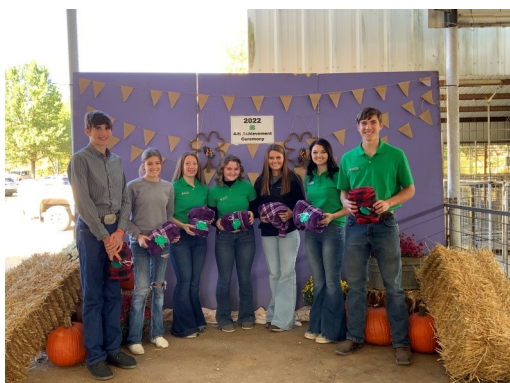
2022 Camp Counselors