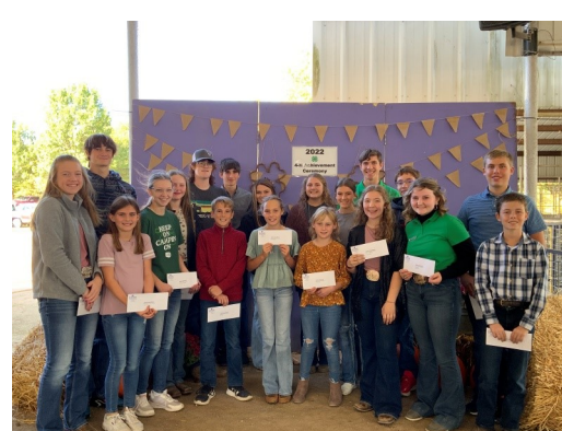
Banker's Award Winners