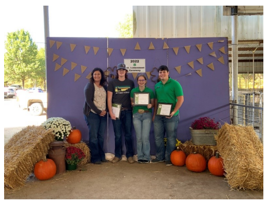
Key Award Winners