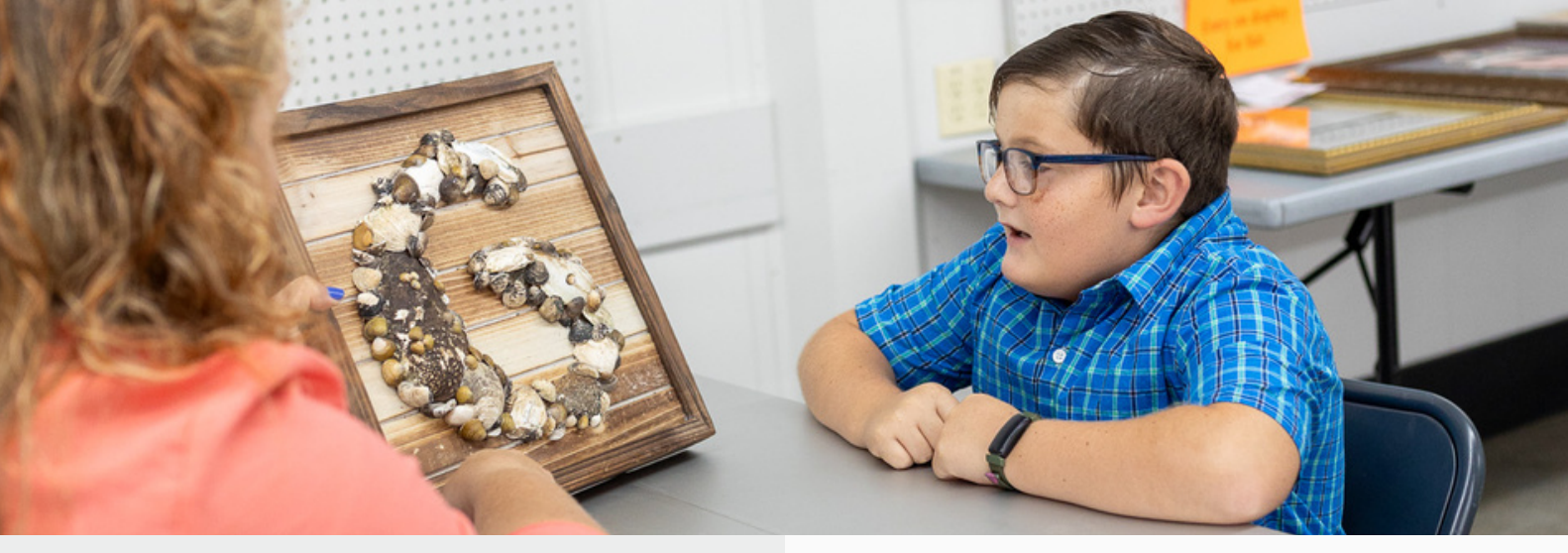
EXHIBIT DROP OFF

ALL EXHIBITS <u>EXCEPT</u> FOR FOODS & NUTRITION, CROPS AND HORTICULTURE ARE TO BE DROPPED OFF AT THE 4-H BUILDING