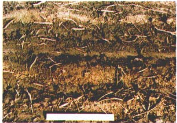
375 lbs/A 10 percent cover 180 lbs SGe