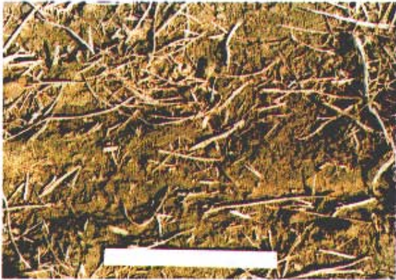
1,250 lbs/A 35 percent cover 750 lbs SGe