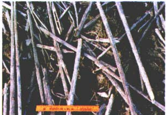
6,900 lbs/A 60 percent cover 2,000 lbs SGe