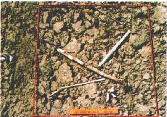
1,500 lbs/A 15 percent cover 250 lbs SGe