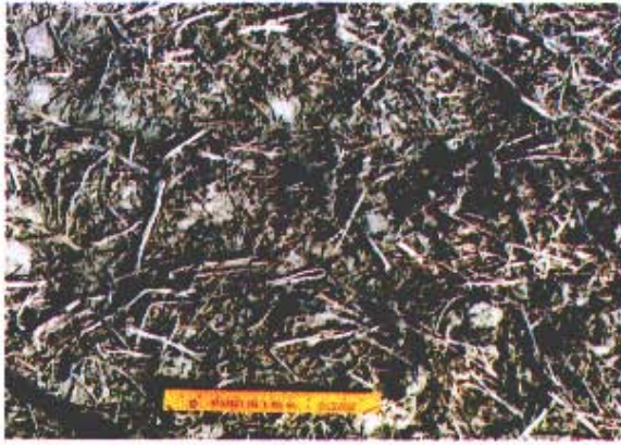
4,000 lbs/A 85 percent cover 3,000 lbs SGe