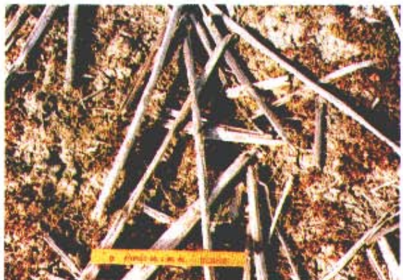
2,400 lbs/A 35 percent cover 475 lbs SGe