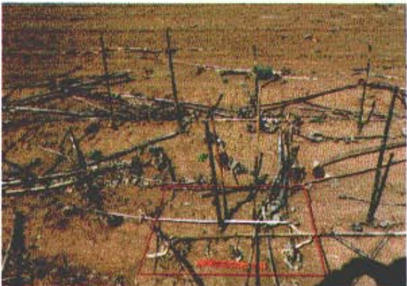
2,000 lbs/A 430 lbs SGe