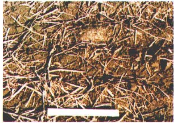
1,775 lbs/A 50 percent cover 1,250 lbs SGe